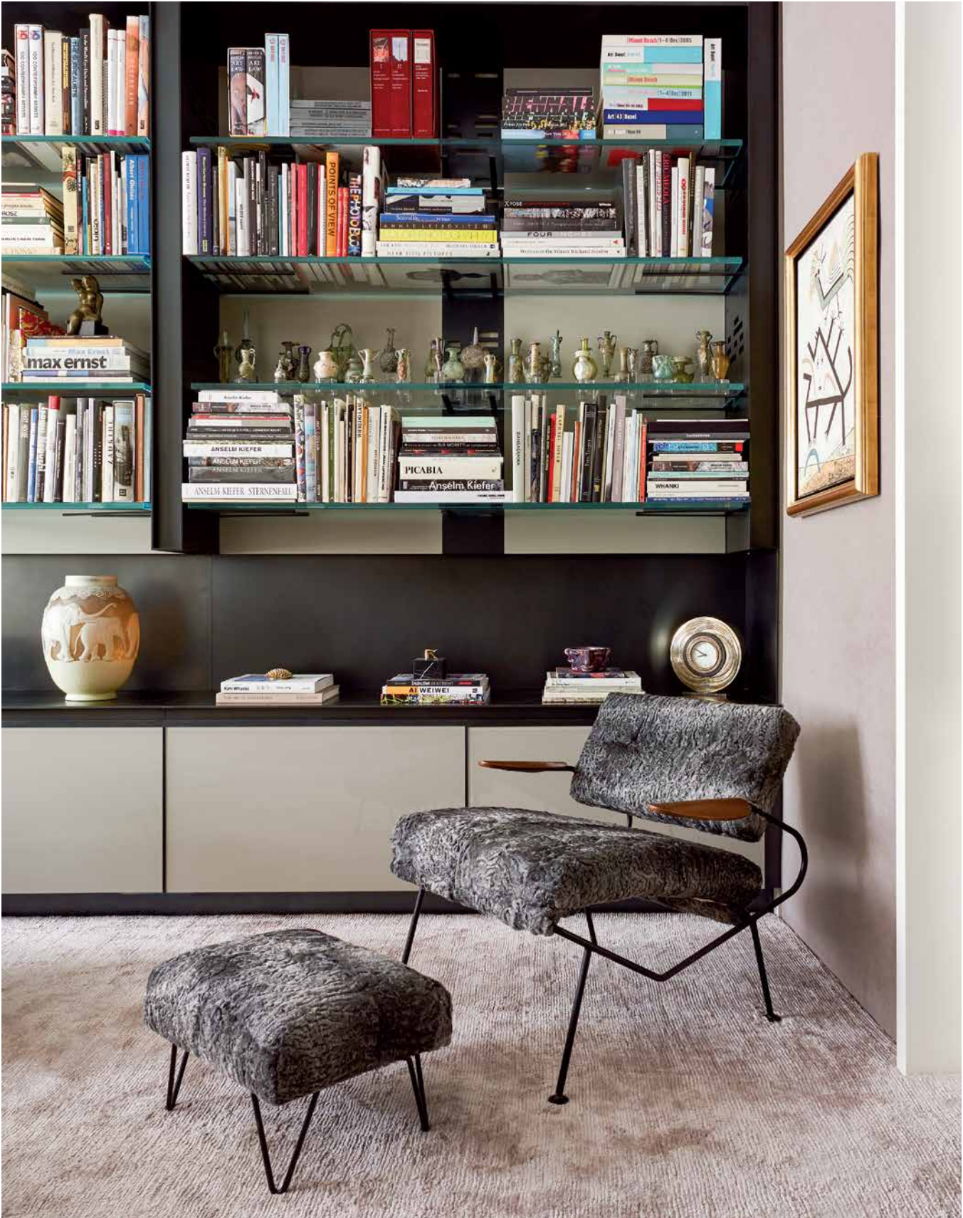
In the library, a custom bookcase made of lacquer and metal holds plenty of room for collectibles such as antiques and a white-glass elephant cameo vase by Émile Gallé from the 1920s; walls covered in gray mohair add soft texture. A painting by Victor Brauner hangs above a metal-framed chair and ottoman from Roark clad in Mongolian lamb.