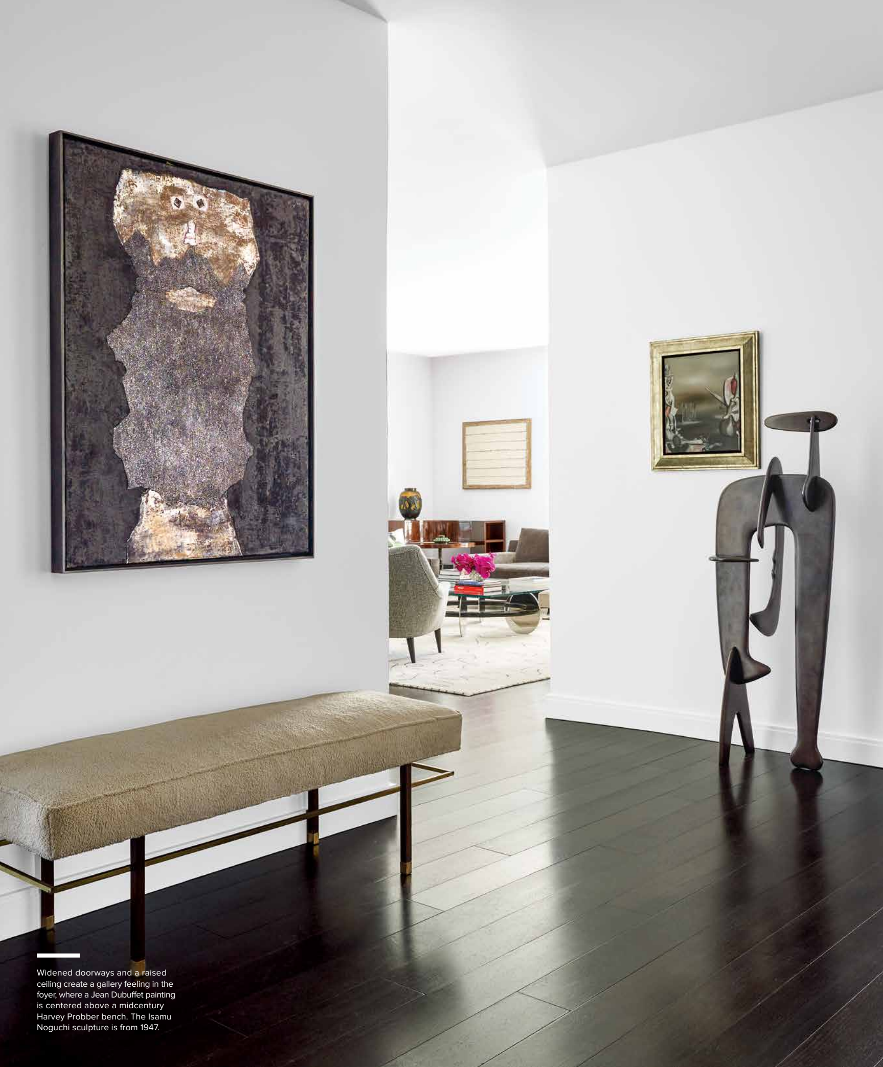
Widened doorways and a raised ceiling create a gallery feeling in the foyer, where a Jean Dubuffet painting is centered above a midcentury Harvey Probber bench. The Isamu Noguchi sculpture is from 1947.