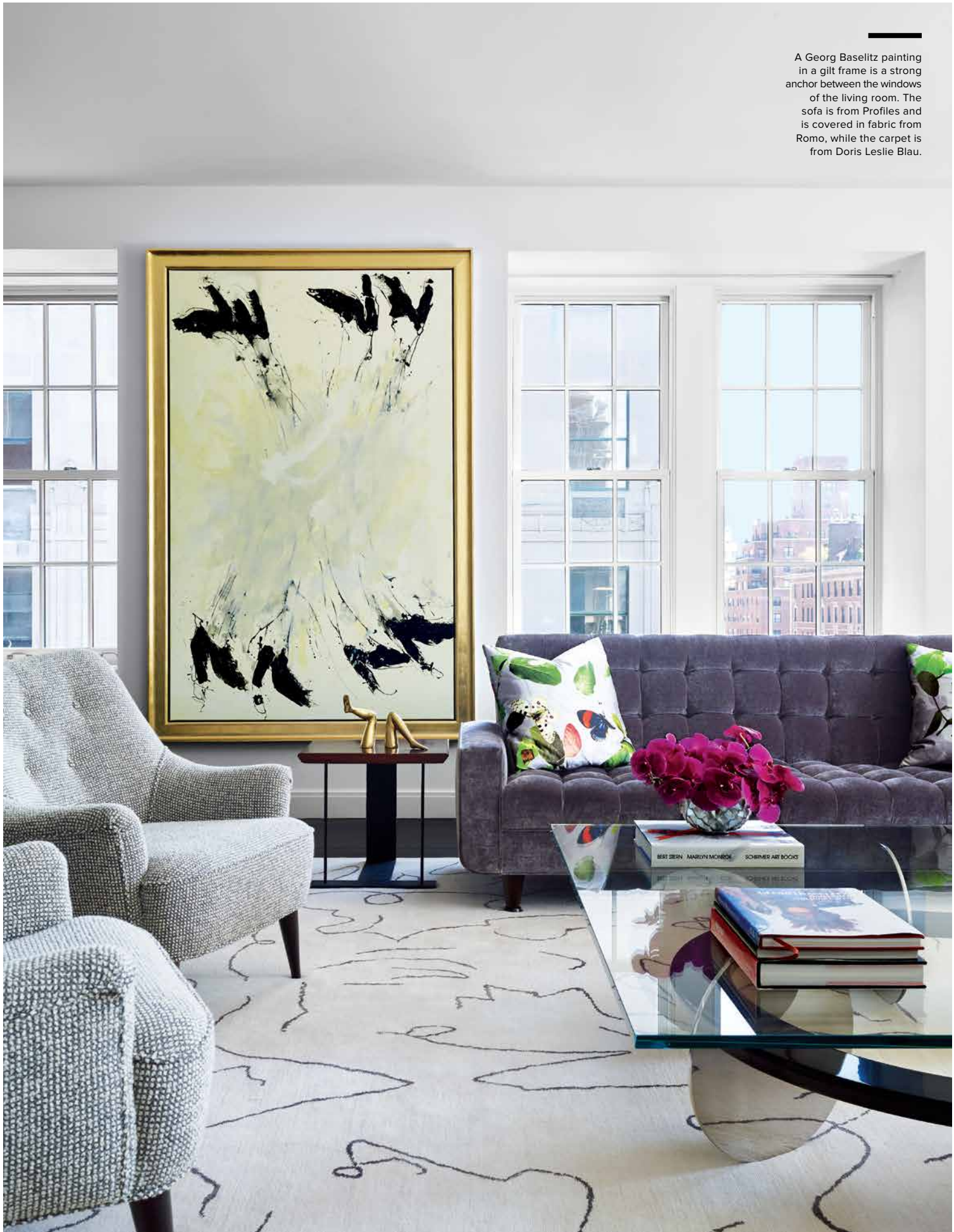
A Georg Baselitz painting in a gilt frame is a strong anchor between the windows of the living room. The sofa is from Profiles and is covered in fabric from Romo, while the carpet is from Doris Leslie Blau.